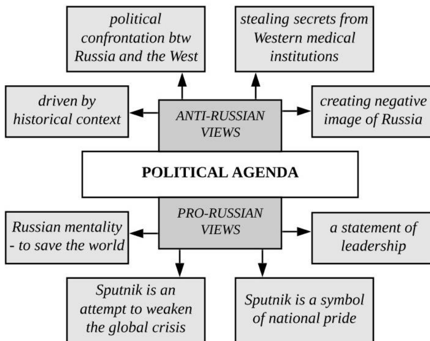
Figure 1. "Political Agenda"