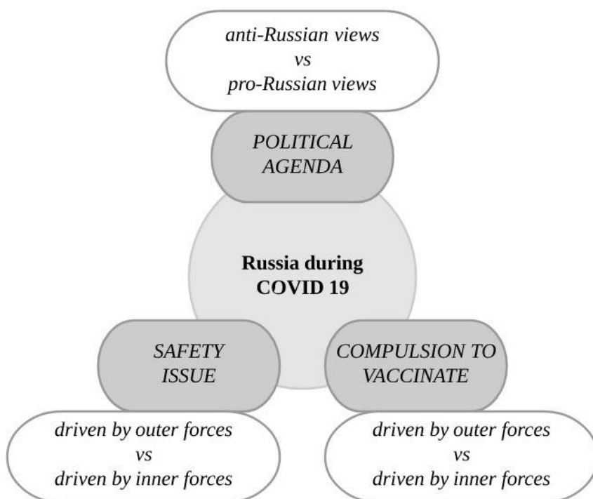
Figure 4. Representation of Russia's Image in English-language mass media during Covid 19